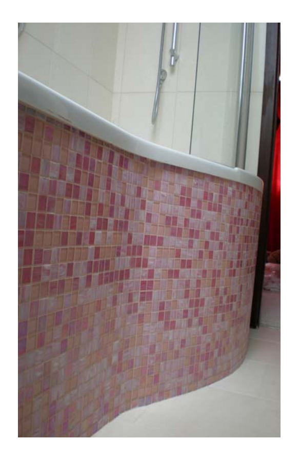
The look, texture and slip-resistance of the treated surfaces are unchanged.